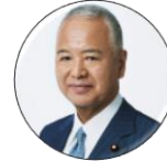
Akira Amari Former Member of the House of Representatives Honorary Chairman, Diet Members Caucus for the Promotion of Semiconductor Strategy (., LDP)