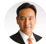
8:33-9:03 Daishiro Yamagiwa, Member of the House of Representatives, Liberal Democratic Party

8:30-10:05 Session 4 Japan's International Competitiveness