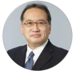
13:55-14:25 Special Address 1 (Remote Live) Satoshi Nohara, Director- General, Commerce and Information Policy Bureau, METI