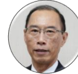
Ryuichi Yokota Mayor Chitose City