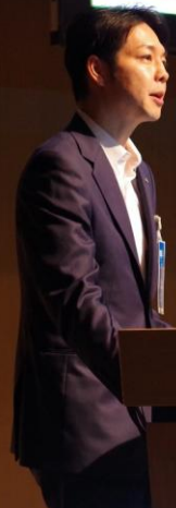
Naomichi Suzuki, Governor of Hokkaido