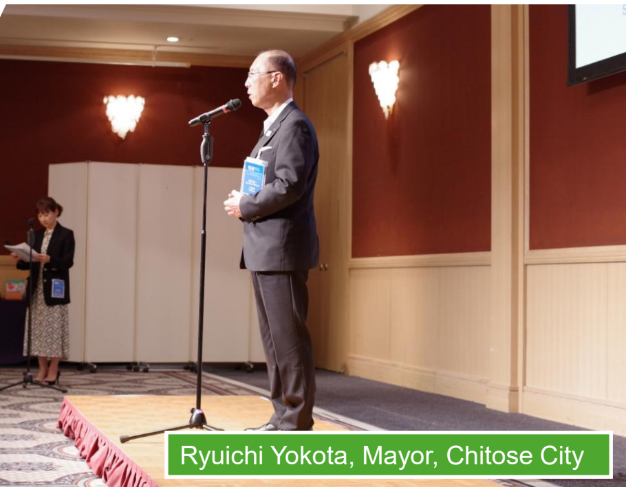
Ryuichi Yokota, Mayor, Chitose City