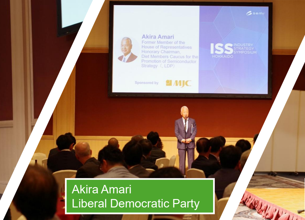
Akira Amari Liberal Democratic Party