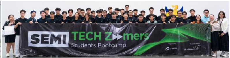
Industrial Visit to Luxshare ICT