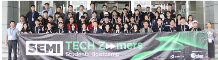
Industrial Visit to Amkor Technologies

TalentCONNECT brought together students, young professionals, educators, and industry leaders to explore career pathways within Vietnam's semiconductor sector. The program featured discussions on IC design, AIoT, and smart manufacturing, and concluded with industrial visits to Amkor Technologies and Luxshare ICT to provide participants with practical, on-site exposure.